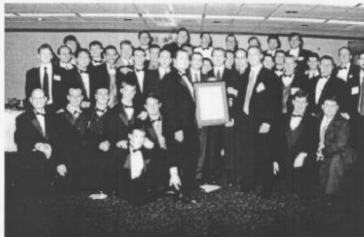
The Undergraduate Brothers receive the Charter at the Banquet on November 3 rd

their unconditional understanding of brotherhood. In the annual Food Drive, our brothers raised 65,000 pounds of food and placed 11 th out of 200 in the nation. Lambda Chi Alpha International Fraternity granted our Zeta its charter and brought together generations of Theta Tau Brothers. Also, as the semester came to a close, negotiations with the Student Life Committee secured the lounge below our letters. The agreement provided ASIA, a minority student organization, one of the rooms in the lounge, and we are looking forward to a fruitful partnership. Once again, Lambda Chi Alpha lounge space, housing and letters will be brought together. Yet the undergraduate brothers of Theta Tau believe that the current semester will be the best yet. On February 2 nd , we welcomed nine new members into the Lambda Chi Alpha family. The Association ceremony was held in Wingate, and the evening