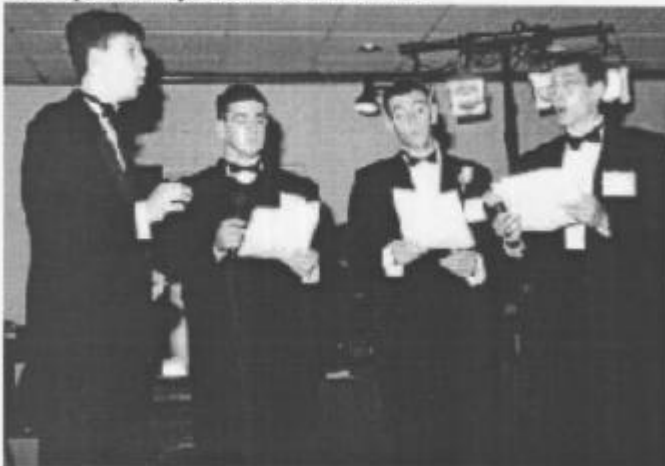
Undergraduate brothers sing a few traditional LXA songs at the Charter Banquet.

The calendar for this semester promises to be exciting for everyone. Thus far, 50,000 pounds have been raised for next semester's Food Drive, and more events have been lined up to bring the total above 90,000 before we even begin the fall semester. We will again be working with the Adam's Mark Hotel in Winston-Salem to raise funds for our lounge, and our Vice President has been providing us with more service opportunities than ever before. We have scheduled parties and cookouts with many of the sororities on campus, including Kappa Kappa Gamma and Chi Omega. In February we will be having Brotherhood ski retreat, and of course, come May, the much anticipated Myrtle Beach Formal.