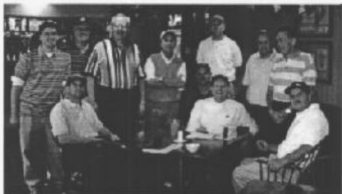
Brothers gather around after a game of golf during Homecoming weekend.

exceptional. Their messages were loud and clear that certainly the LXA Chapter at Wake Forest is on an unusual path when it comes to fraternities. The dedication to the true ideals of brotherhood along with the self-imposed discipline that our Chapter maintains is a unique situation in today's fraternity environment. It is also that environment that is going to get the support from universities and national fraternities in the future. You can be proud that our fraternity is the leader on the Wake campus in so many categories that really matter, and I'm sure will be the model for the International Fraternity in the future.