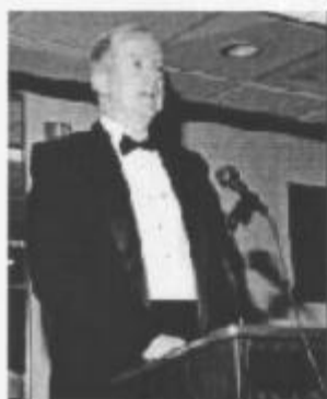
The Grand Hi Pi from the international Fraternity gives a speech before presenting the charter to the brotherhood at the charter banquet.

Many of our brothers from a wide variety of classes attended this special weekend event. Naturally there were many that I had never met, some older but most younger than myself. It was fun reliving the times and comparing various campus and fraternal activities that each shared and to