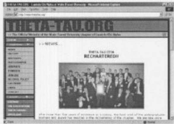
Screenshot of the new website for Theta-Tau chapter of LXA.

As such, it has become increasingly obvious to me that our former website would no longer "cut it." It had been sufficient for a student organization with less than thirty members. However, as the alumni association grew, I recognized that the website no longer represented just the undergraduate chapter—it now represented all graduates of Theta-Tau Zeta, especially the 150+ active brothers of the association and current undergraduate membership.